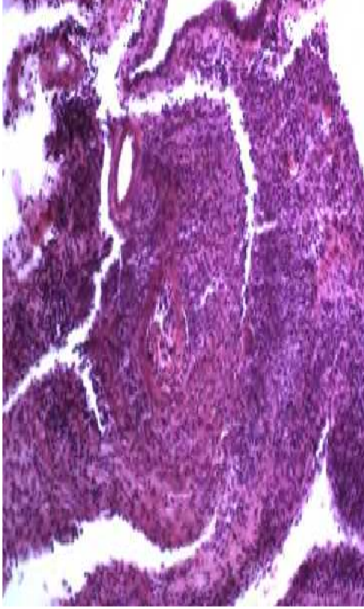
(c) Tuberculous meningitis, panvasculitis with alteration. H&E, × 140